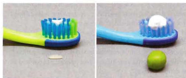
Figure 1. For children younger than 3 years, use only a small amount of toothpaste (about the size of a grain of rice). For children older than 3 years, use no more than a pea-sized amount.